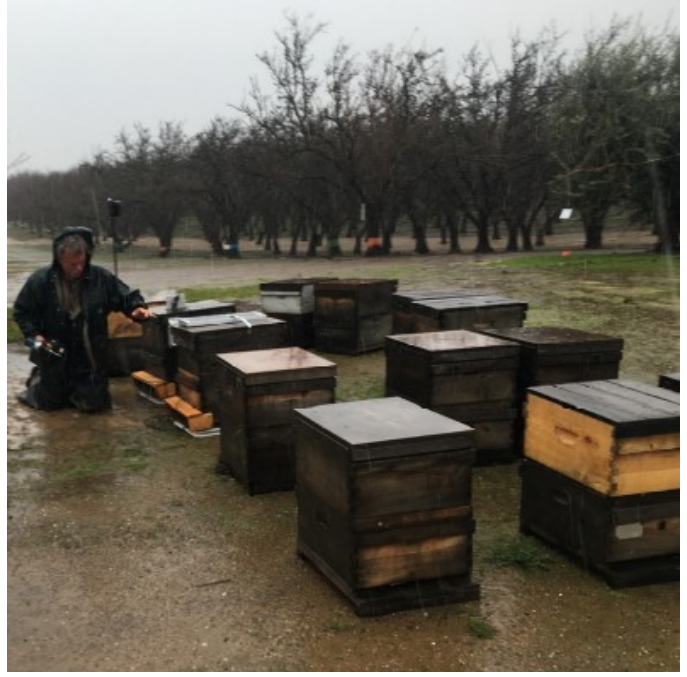
In this orchard in Durham, the water had risen above the hive entrances, but we were able to drag the hives up onto slightly higher ground.